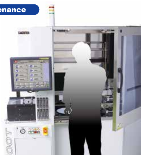
The large door and processing space increased the maintainability.