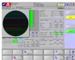
New GUI ►